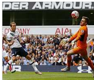
How to See Top Flight Football for Free (Barclays Premier League Football)