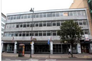
Police shut down Wimbledon's 'first ever' illegal rave in former job centre