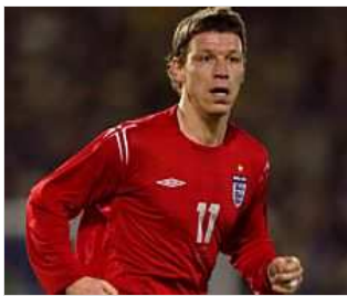
18 Epically Bad England Players (The Sports Mash)