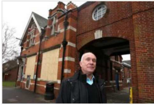
Disgust as 'pure animals' cause huge damage to derelict post office at mass all-night rave