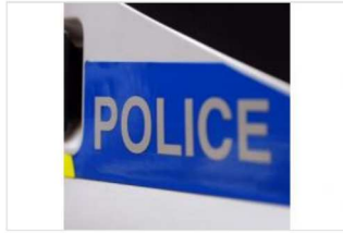
Police injured in rave stand-off