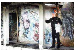
Evidence of drug use found after late night rave