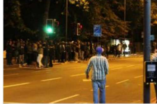
Teenager stabbed at illegal Finsbury Park rave