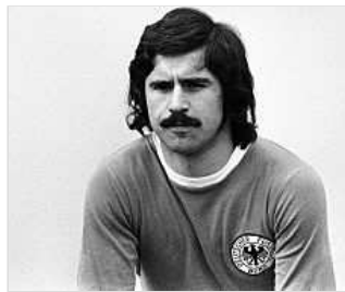
Germany legend Gerd Muller suffering from Alzheimer's