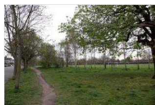
Police crack down on illegal rave planned for Wandsworth Common