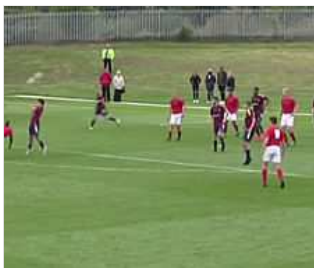
Is this the greatest last-minute winner you've ever seen? (Dream Team FC)